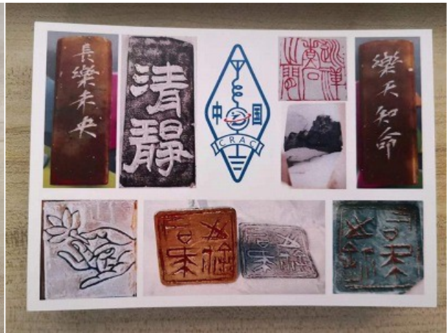
QSL card front