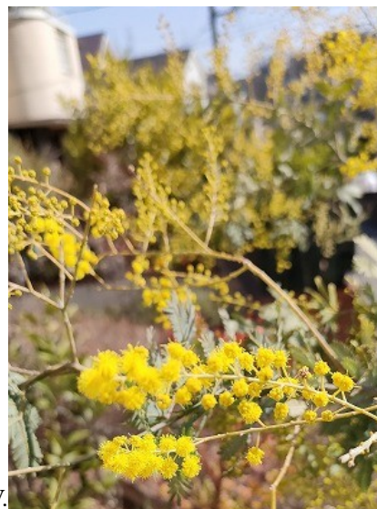
Mimosa in the garden of Atsu, JE1TRV.

According to data from SILSO ( https://www.sidc.be/silso/home ), sunspot number exceeded 200 and reached 206 on 19 January 2023 for the first time in this cycle 25. It is the first time to exceed 200 since 27 February 2014 when it reached 220. I think the HF conditions are already the same as the peak of the previous cycle 24. As Manabu mentioned above, the high band conditions are good lately. You can enjoy DX QSO even with a simple antenna and barefoot power. Why don't you give it a try? Our goal should be to achieve world peace. 73/88 and stay sober de Nao.