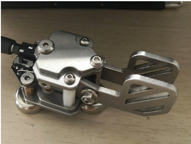
BG0AHB Iambic key

Look forward to making QTT (real CW with honest RST and exchange at least OP name and QTH) QSO with you! VY 72 es 73 es 77 (long live CW)!