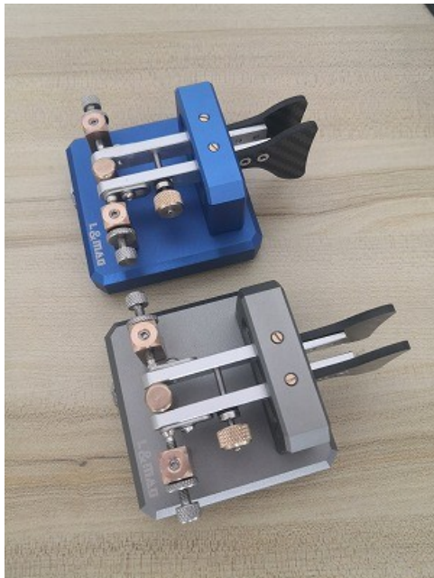
LAOMAO (BH4UAC) Iambic keys