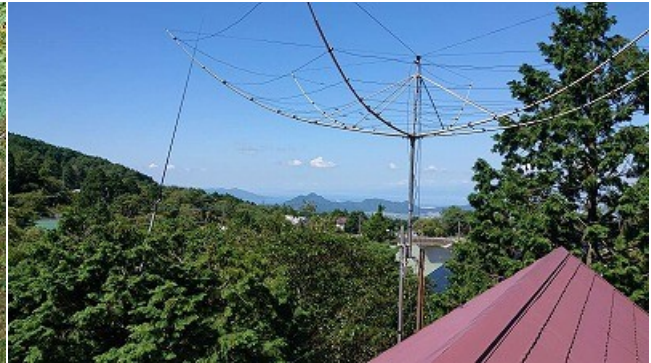
The final location of the HEX BEAM at my IZU QTH (June 2020) - with a view to the W/NW

At that time I so happy to have the HEX BEAM up in the clear that my only means of rotation of the HEX BEAM - although an “ARMSTRONG ROTATOR” (MANUAL ROTATION) - was totally acceptable to me and no problem at all!