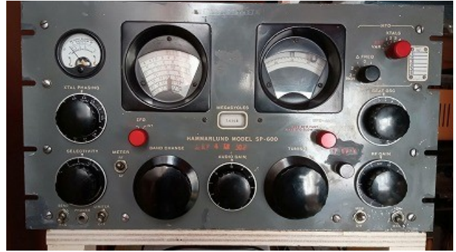
Figure 1. SP-600-JX-17 on a working bench

The BC779B is a single super receiver with 18 vacuum tubes, that was produced during World War II (mine is from 1945, a bit older than my age). On the other hand, the SP-600-JX-17 is a double super receiver with 20 tubes manufactured in 1952 (single super receiver below 7.3 MHz). The BC779B has a separate power supply and the main body weighs about 20 kg. Alternatively, the SP-600 has an integrated power supply and weighs well over 25 kg. Both are "boat anchors", that need a movable working bench for this old man to handle.