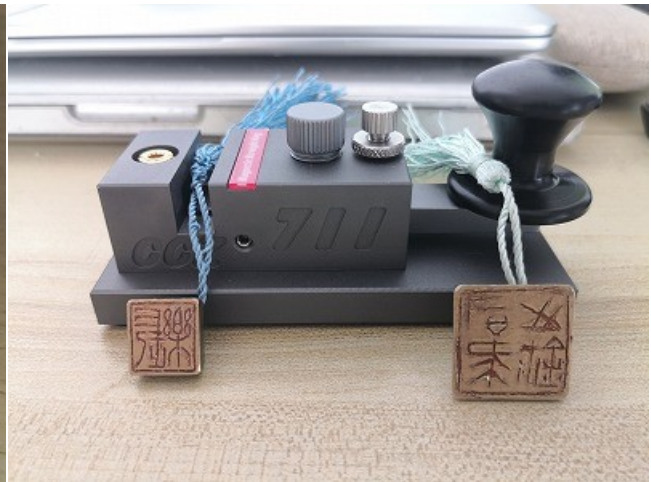
CCZ711 cicada magnetic straight key