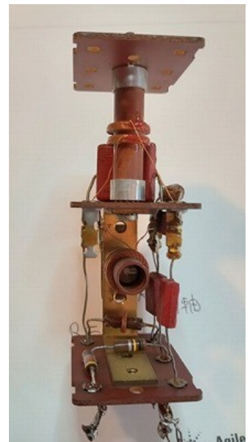
Figure 2. BFO coil of the SP-600-JX-17

So, I checked every part around 6C4 and found that the coil in the Colpitts circuit was suspicious. Apparently, it was beautiful (no scorch marks, obviously in Figure 2) and seemingly had no problems. However, I found the upper coil lost conductivity after a detailed inspection. If the coil was disconnected somewhere inside, it must be unmanageable. However, I remember that the bonding of an old IFT coil had been disconnected at its terminal. So I scraped both ends of the coil wire and checked the continuity of the coil again. Glad to find the continuity! Then building back the BFO