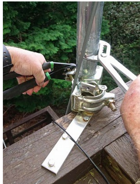
The scaffolding coupling serves as a brake and the grippers as my “ARMSTRONG ROTATOR”. (Being close to my Operating Position - I can quickly rotate the HEX from the 2nd Floor Balcony)

The HEX BEAM itself is not very heavy but the supporting pole is steel - so the combination required a rotator with some “GRUNT”.