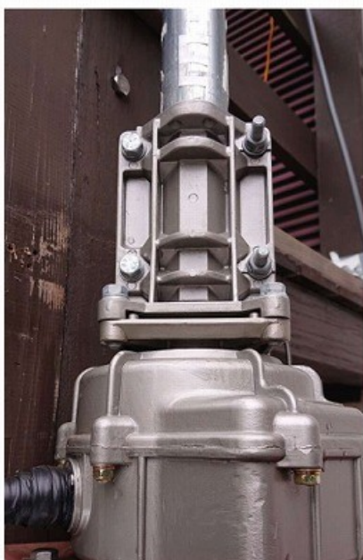
CREATE DESIGN DRIVE Unit

Due to work commitments the Rotator sat on the shelf for a while but in late 2022 / early 2023 - I finally got the Rotator/Controller installed and interfaced to my Remote PC Controller so that I can now remotely control the rotation of the HEX Beam.