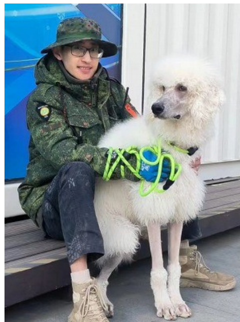
With my beloved dog Andreas he is a standard poodle.

If you ask me how ham radio and CW attracted me, well, it is a good question. Like some other hams, my curiosity and affection about radio can be dated back to my childhood.