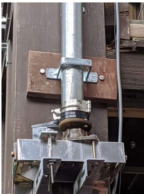
The bearing from an old Water Pump from my “Delica Van” in VK4 served as a rotating base!