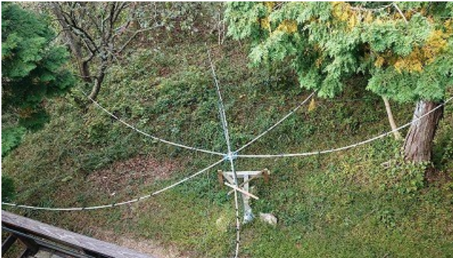
Spring 2019 ..... still there!

The HEX BEAM had been installed at ground level since 2017 and although it performed well in that location - I was sure it would be even better when “up in the clear”. (see my earlier article in morsEAsia of Oct 2020).