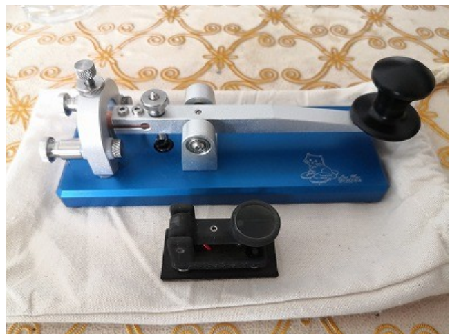
LAOMAO (BH4UAC) Straight Key es 3D Printed Key