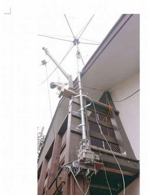
A 2nd Hand CREATE DESIGN Rotator drive replaced my Water Pump Bearing!