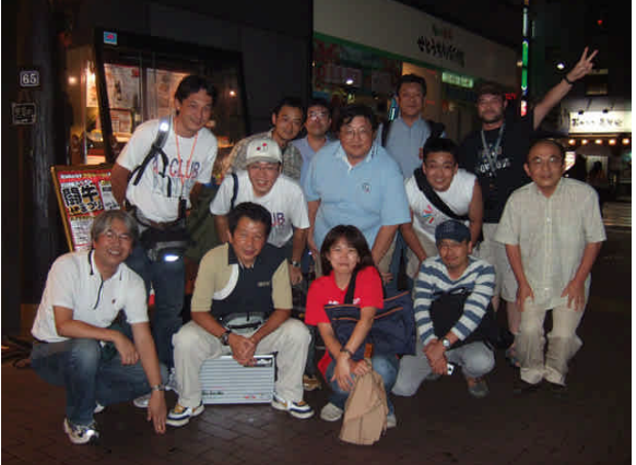
The FEA annual meeting had also held. We had good time at eyeball QSO. Some members went to second stage of meeting, KARAOKE, after taking above right picture. -- Taro