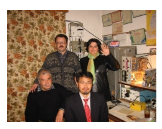
With 4J5A 4J8YL 4K4K