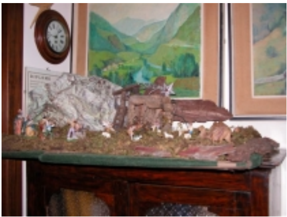
morsEAsia Page - 5 - February, 2006