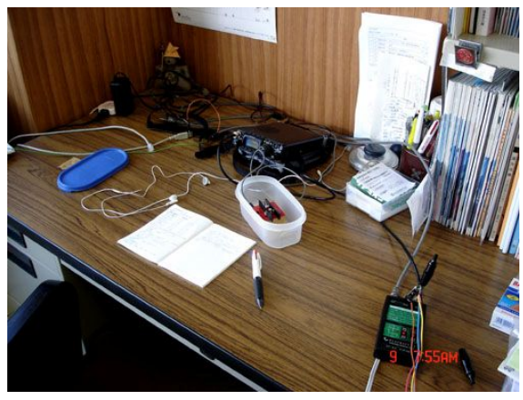
morsEAsia Page - 5 - December, 2005