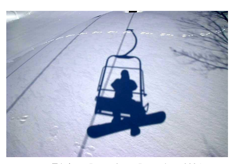
morsEAsia Page - 2 - December, 2005